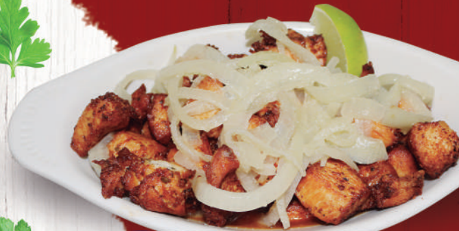
FRIED CHICKEN CHUNKS