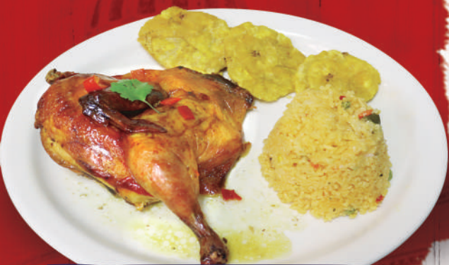
HALF CHICKEN ROASTED OR FRIED