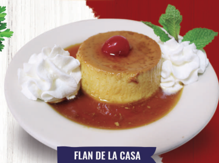
FLAN DE LA CASA